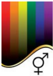
Bisexual Rainbow Flag