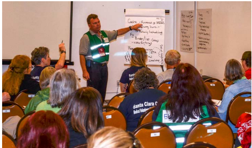
Volunteers debriefing at EMSA's Golden Guardian Field Exercise

Consider having a personal family disaster plan in place. Personal medical conditions may need to be evaluated. Consider the safety and well-being of your family if you respond. Emergency response can be physically and emotionally difficult.