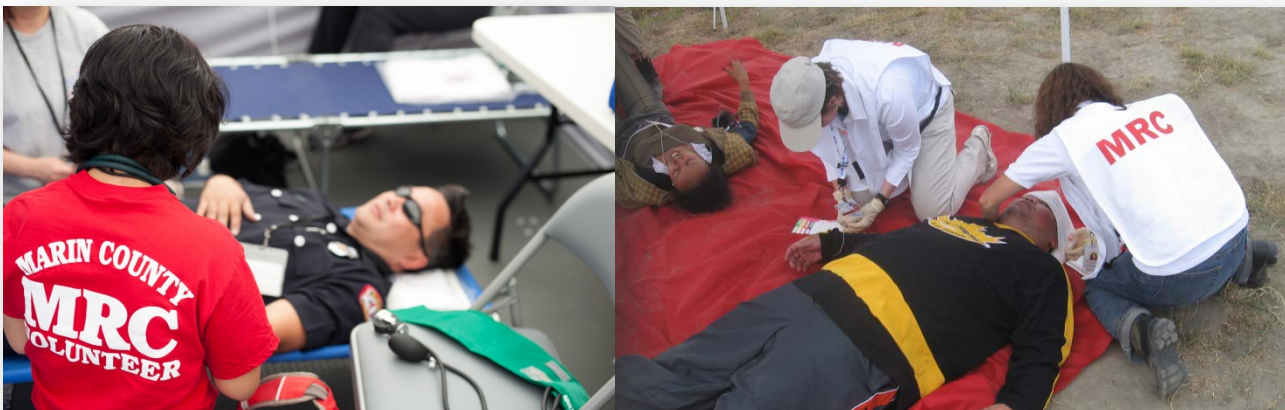
Volunteers above are practicing patient triage during an exercise in the Oakland Coliseum

By registering and agreeing to these Terms of Service, I agree that the information I provide and the representations I make at this Site will be truthful, complete, accurate, and free of any attempt to mislead. I understand that I may return to this Site and modify my personal information at any time, and I agree to keep such information updated and current. I agree to protect the confidentiality of the password I have chosen that provides access to my information on this Site, and I agree to abide by all security provisions of this Site.