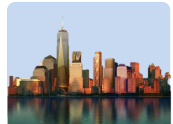
New World Trade Center, 2013

One of the findings from after-action evaluations of the emergency response activities was the reality that the emergency response system and the healthcare system did not have a way to verify licenses and credentials of the professional volunteers who wanted so desperately to serve in the relief efforts. With this realization, federal officials called for the creation of a national system to pre-register and pre-credential healthcare professionals who expect to serve in an emergency response. This system is known nationally as the “Emergency System for Advance Registration of Volunteer Health Professionals (ESAR-VHP). Each State was challenged to create this system at the state level. In California, the system is known as “Disaster Healthcare Volunteers” (DHV). The professional healthcare community in California has responded admirably by registering over 20,000 healthcare professionals on the DHV System.