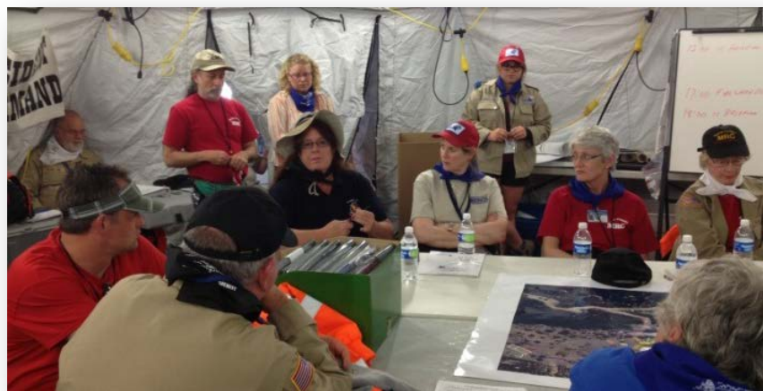
Volunteers above are participating in field training at the Austere Medical Exercise in Ventura

A Volunteer Code of Conduct is provided on p. 23 in this Volunteer Handbook. This code does not preempt or preclude local MRCs or other units from establishing additional expectations or conduct codes for DHVs or MRC members.