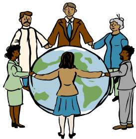
People Coming Together

The Consortium advocates on behalf of people infected with and affected by HIV/AIDS. The Consortium plans and coordinates prevention and care services, and advises government bodies and community leaders while providing support for those at greatest risk for HIV and those living with HIV/AIDS.