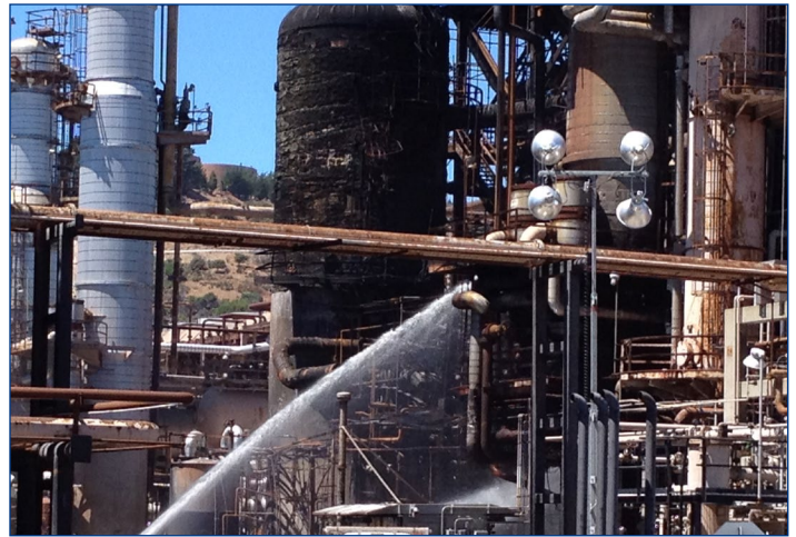
A scene from the aftermath of the August 2012 fire at Chevron's Richmond refinery.

Another added provision authorizes our Hazardous Materials Programs to develop "process safety performance indicators" that must be tracked and measured by refineries. The county's Industrial Safety Ordinance (ISO) was first enacted in 1999 and was designed to prevent industrial accidents. The city of Richmond's ordinance is modeled after the county's ISO. Both ordinances are administered by our Hazardous Materials Programs.