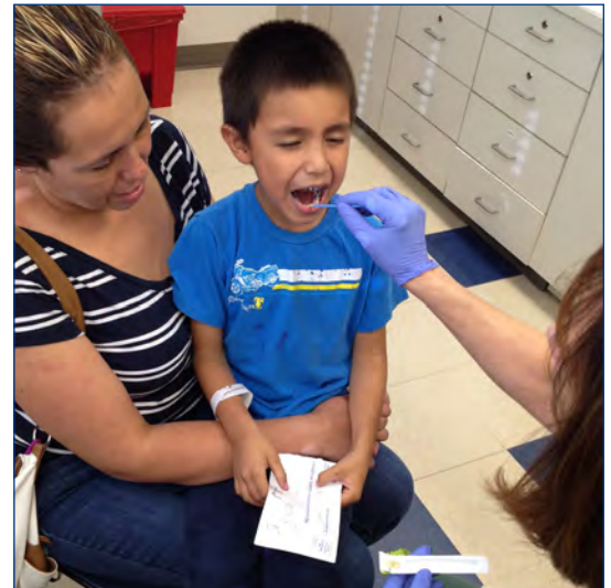
A young patient at Concord Health Center gets fluoride varnish applied during a doctor’s visit to protect his teeth from cavities.