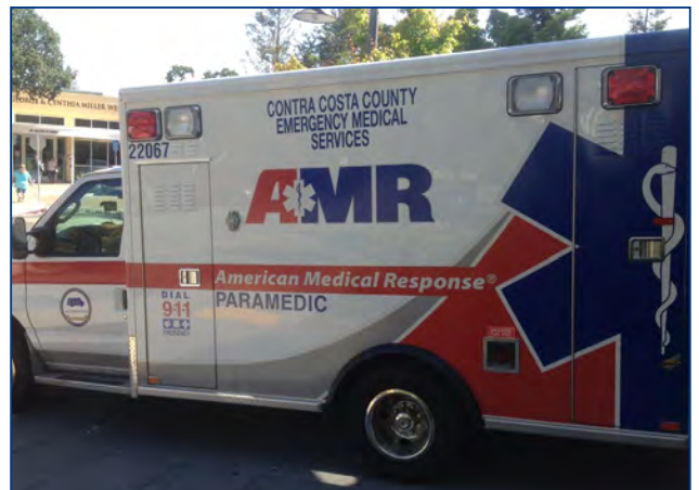
Under the new contract, American Medical Response will team with Contra Costa Fire to service the county.

Under the new model, Contra Costa Fire intends to directly dispatch AMR crews in Contra Costa County’s exclusive operating areas, which account for approximately 90% of county 911 services. The remaining 10% of emergency ambulance services are provided by the Moraga-Orinda Fire and San Ramon Valley fire protection districts, which provide their own emergency ambulance services. AMR previously held the county’s ambulance contract exclusively. The changes are expected to streamline delivery of services to the public and include cost-saving strategies identified in the 2014 EMS System Modernization Study.