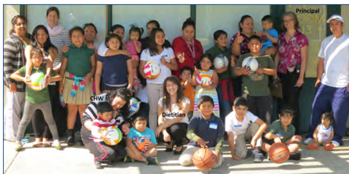
Active & Healthy Families participants and providers at Fremont Elementary School in Antioch.

AHF, which is managed by Public Health Clinic Services, is a pediatric obesity medical group appointment program designed to educate families and support obesity prevention. The program, which serves children 5 to 12 years old who are overweight or obese, consists of eight bi-weekly sessions facilitated by a nurse practitioner, registered dietitian and community health worker. The group appointments are available at select school-based clinics in Richmond, Concord, Pittsburg and Antioch.