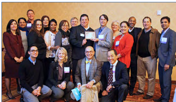
The CCRMC & Health Centers team won the Quality Leaders Award from the California Association of Public Hospitals/Safety Net Institute earlier this month for its "advanced access bundle."